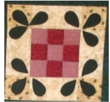
Ted's Sampler Fabric 2: Tan pattern Fabric 3: Red pattern Fabric 4: Red check Fabric 5: Dark green

Using the fabric 3 and fabric 4 - 2½” squares, sew the centre nine-patch