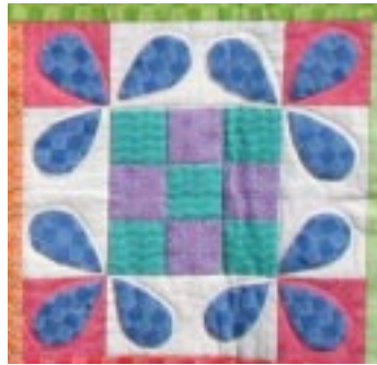
Charlee's Quilt Fabric 2: Pink Fabric 3: Purple Fabric 4: Green Fabric 5: Blue